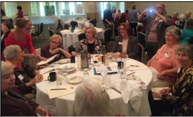
AAUW Fall Focus

The AAUW NJ Fall Focus was held on Saturday, October 17. The well-planned agenda was packed with informative speakers addressing human trafficking, campus leadership, global health, Title IX, $tart $mart, Teentech, Tech Savvy and Tech Trek. Our GWA Branch had a display entitled “Girls Hall of Fame Networking and Program Potential.” We also had a few minutes to explain our objectives to network, enhance our identity within the community and solidify positive relationships with organizations such as PCTI.