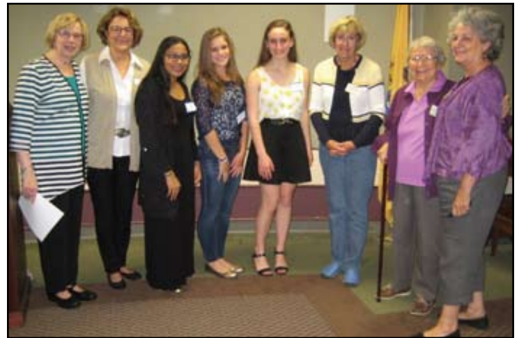
Girls Hall of Fame Committee plus our inductees

This year each inductee was presented with a citation from her home town and one received a citation