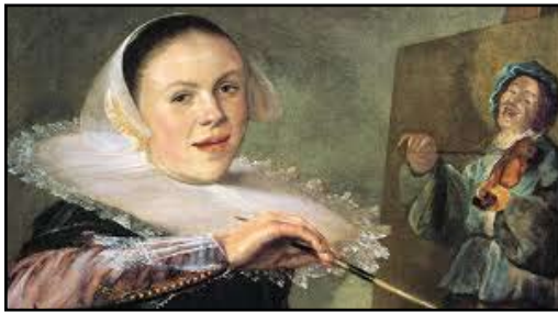
Judith Leyster, Dutch, 1630 Self-Portrait

The next Art Interest Group will meet Wednesday, November 18th, 1:30 - 3 PM. We will observe the works of artists who are women from Renaissance through Baroque including Judith Leyster and Charpentier/Villers.