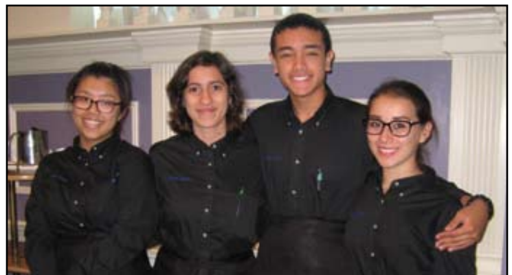
1 Culinary Arts Students