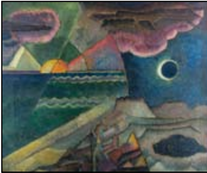
Marguerite Thompson Zorach

On March 2nd we viewed Romanticism, Realism and Impressionism. On March 16th we will continue into our venture into Modern styles painted or sculpted by artists who happen to be women and who have become part of abstract-movement groups: post-impressionists, geometric-abstractionists, expressionists and surrealists. The artists will include: Marguerite