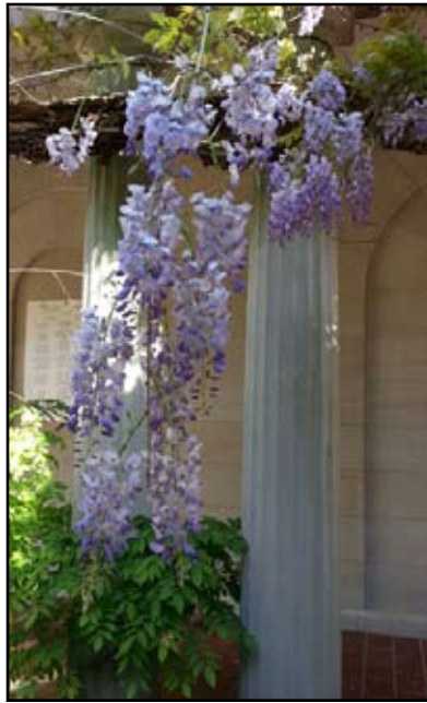
Van Vleck wisterias

Please join us on Friday, May 13, 12:30 p.m. for a cafe lunch at Uptown 596 Bistro, 596 Valley Rd., Upper Monclair. After a delicious lunch of paninis, entree salads, soup, or hot dishes, we will visit the Van Vleck House and Gardens, Van Vleck St., in Montclair, and justly famous for its outstanding spring wisteria and other blooms.