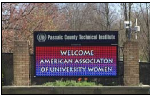
On April 19 our branch held its annual meeting at Passaic County Technical Institute.