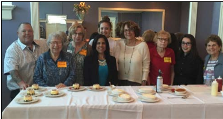
Members with head chef and assistants. Following the business portion of the meeting, we enjoyed a delicious lunch prepared and served by the PCTI award-winning culinary students.