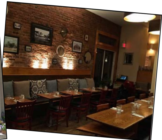
596 Uptown Bistro

Games Night is open to all members. Please call the hostess at least 3 days in advance to let her know you are coming.