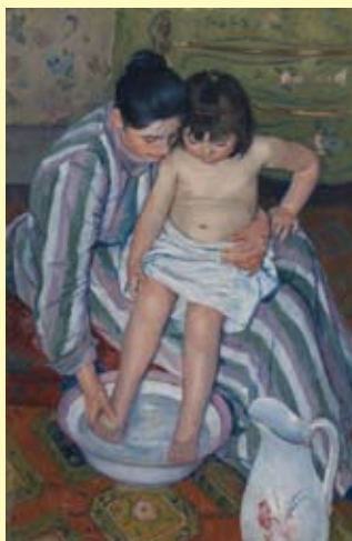
The Child's bath 1893

Mary Cassatt was the first American woman to achieve enough rank with her paintings that she was/is posted in art history books - sometimes as an American since born in USA and sometimes as French because she worked with French Impressionists. She introduced Impressionism in the USA with her painting and travels back and forth to France. We will review American Impressionism on Tuesday, January 9th, 2 PM (snow date will be Tuesday February 13th).