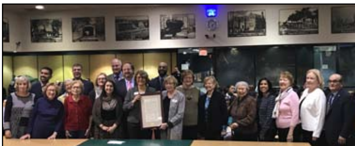
GWA members accepting the award from the Passaic County Board of Chosen Freeholders

On March 27th several members attended the Passaic County Board of Chosen Freeholders' celebration of Women's History Month. GWA received recognition of our Branch's continuing mission-based work in