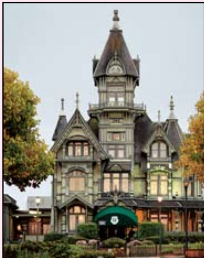
Carson Mansion, California, Victorian architectural style