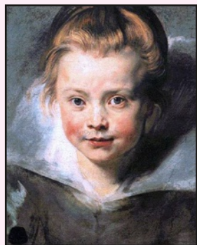
Painting by Rubens

The last two meetings of 2019-2020 will be on the second Tuesdays of March and April. March 10th, we will observe the development from Renaissance into Baroque in the northern European countries emerging