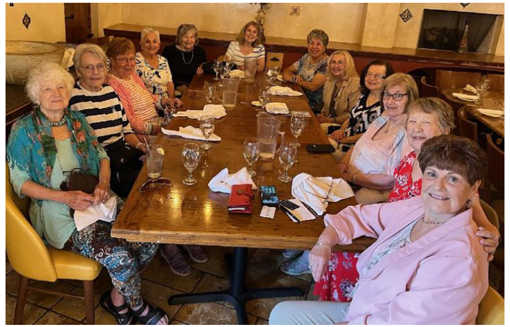
Lunch Bunch at Portobello Restaurant

This group meets on the second Thursday of the