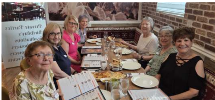
Kervan Mediterranean Grill, Linclon Park